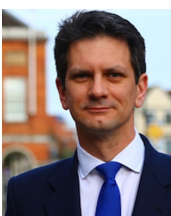
Steve Baker MP

Just as the last few months have thrown-up many challenges and changes for everyone, the same is true for me as your MP. Normally I would attend community or charity functions most weekends but with the coronavirus restrictions these have largely fallen away. I was honoured to attend the Battle of Britain wreath laying in mid-September. I also joined a socially distanced autumn litter pick organised by Wycombe Marsh Community Environment Group. I'm happy to play my part to make us all proud of where we live.